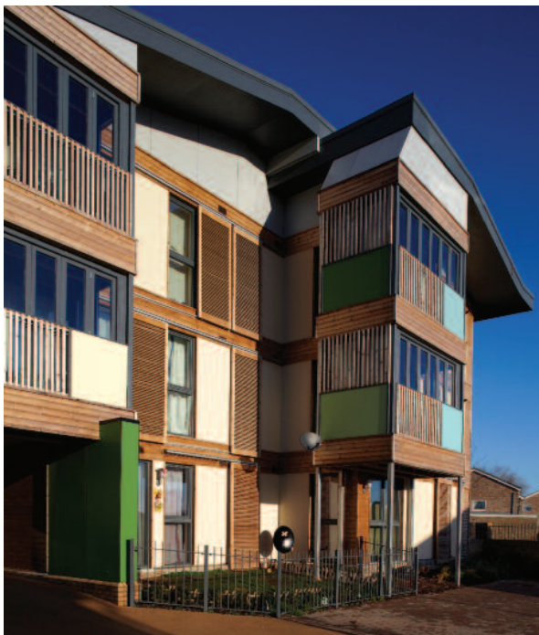
Project - Mayfield Road, Huntingdon